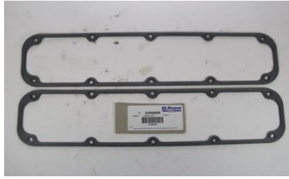
Magnum Valve Cover Gaskets Molded Rubber Price: $25 Part #: 53006695