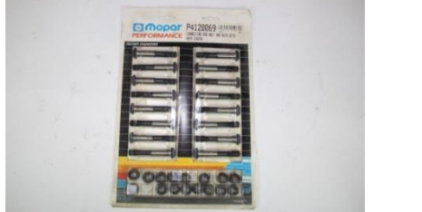
Street Hemi Rod bolts Price: $85 Part #: P4120069