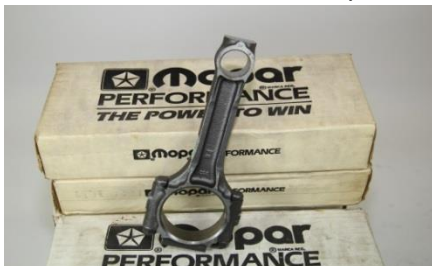
Jeep 360 AMC Rod 5.875 Length Part #: P4529611 Price: $ 225 (8 pc)