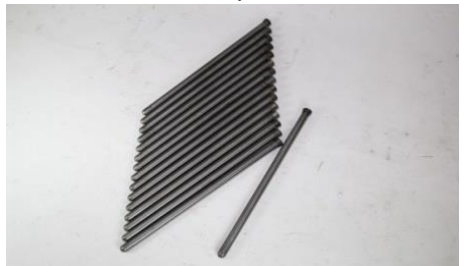
440 Push Rods Solid Lifter Cams Adjustable Rockers Stock Block/ Stock Heads/ 9.175 9.175 OAL 5/16 CUP 3/8 Ball Part #: P4529546 Price: $80 (set of 16)