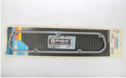
W8 Valve Cover Gasket Price: $ 45 Part #: P4876401