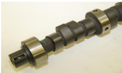
Small Block Hydraulic Cam- LA .508/.508-.248/.248 108 CL Part #: P4120233 Price: $80