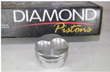
Diamond Pistons- Pins- Rings 540" Wedge- Original B-1 Heads 4.500 Bore- 4.250 Stroke 10cc Dome Top Gas Ports 7.100 Rod-.990 Pin.043-.043-3/16 Rings Price: $1,100