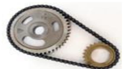
Hi strength double roller timing chain Sprocket Small LA Block & Magnum 1-keyway Price: $26.95