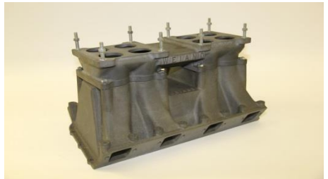
Weiand Magnesium Tunnel Ram 2 X 4500 Dominator NEW Price: $800