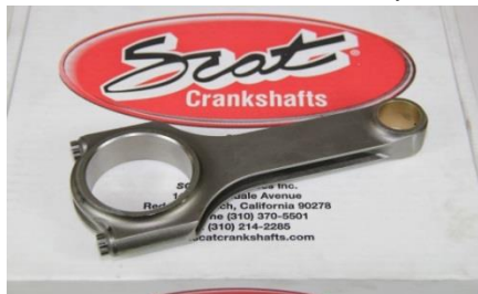
SCAT AMC H-Beam Rods 304-343-360 cu. in. 5.885 center to center Fits 2.095 crank pin .930 wrist pin Price: $450 (set of 8)