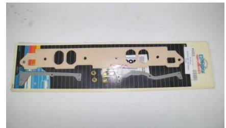
Mopar W2 Intake Gaskets Price: $ 20 (Pair) Part #: P4120210