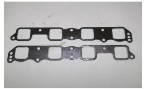
Original 426 Gen II Hemi Ex Gaskets Price: $20 (Pair) Part #: 4120088