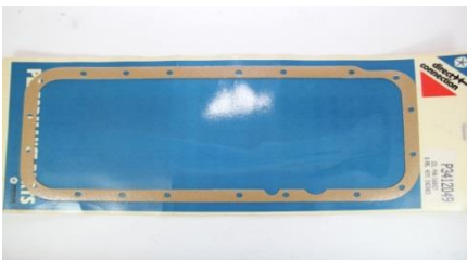
Oil Pan Gasket B/RB, Hemi Engines Price: $15 Part #: P3412049