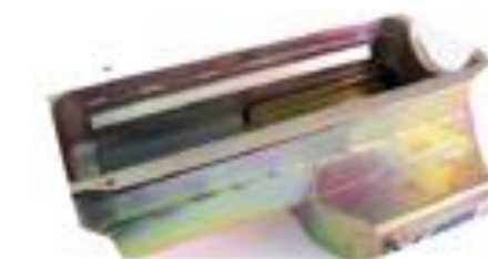
This rear sump pan is for circle track- road race street/ strip fits 360 block 7 deep x 10 1/2 long x 15 wide holds 8 quarts Price: $200