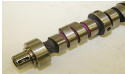
Small Block Hydraulic Cam- LA .410/.425-.211/.218 110CL Part #: P4452757 Price: $65