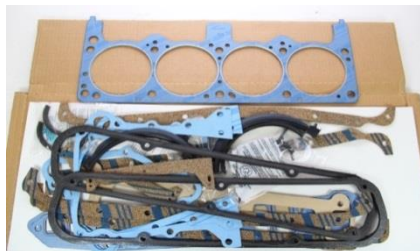
Mopar Perf Complete 340- 360 Gasket Set Price: $60 Part #: P4120692