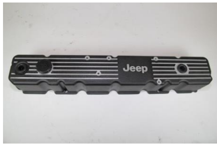
Jeep Cast Aluminum Valve Cover 4.2 Liter 81-86 Replaces Plastic Cover Price: $95