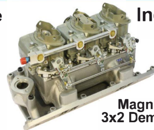
Magnum 3x2 Demon